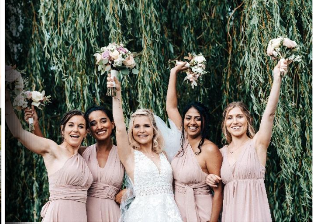
A Day at Deer Park Hall