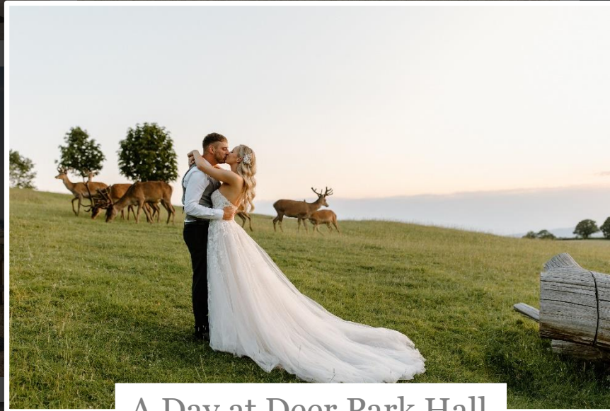
A Day at Deer Park Hall